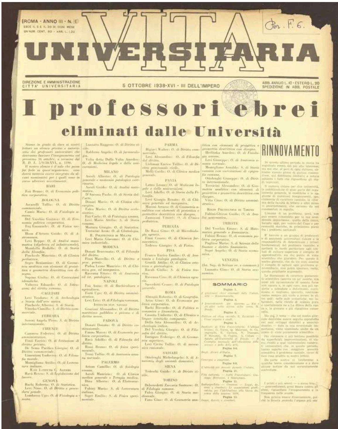
Sapienza newspaper Vita Universitaria (University Life) announcing the expulsion of Jewish professors in October 1938

Digging in state archives, the Sapienza historians uncovered new documents relating to his post-university days, including that along with other Roman Jews, he participated in anti-Fascist meetings and distributing flyers, for which he was briefly imprisoned in 1942. This was a relatively early act of defiance, as resistance to Mussolini's regime was largely muted for most of the Fascist era. It only became more widespread in late 1943, after Nazi Germany occupied central and northern Italy to prop