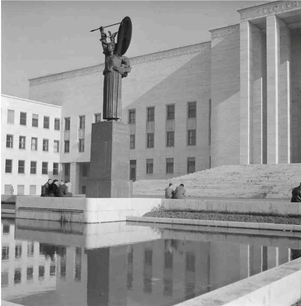
Sapienza University of Rome in December 1937, before the so-called Racial Laws were passed that led to antisemitic persecution.