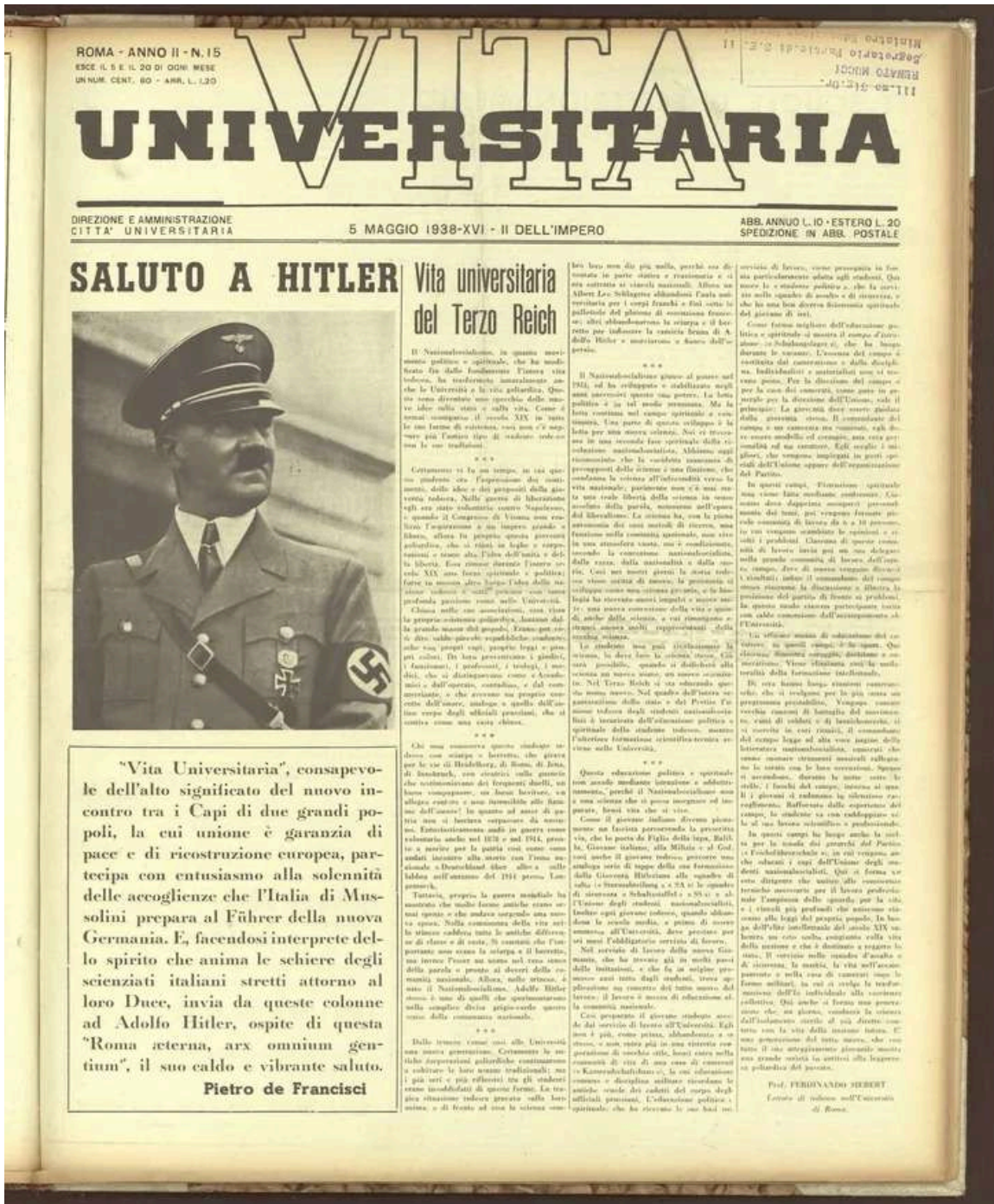
Sapienza newspaper Vita Universitaria (University Life) salutes Hitler's Rome visit in May 1938.

Between October and November 1938, the regime responded with a series of laws that banned Jews from public school, politics, the army and many other professions, restricting their property rights and personal freedoms.