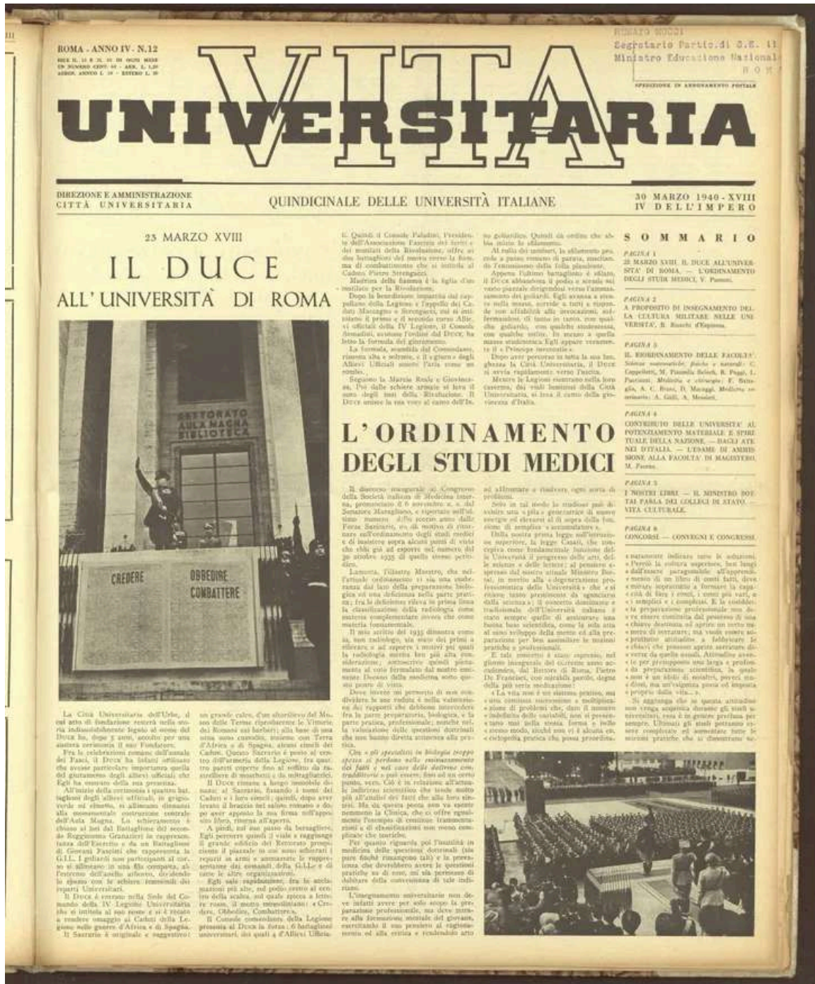
Sapienza newspaper Vita Universitaria (University Life) reporting on Il Duce's visit to the university in March 1940.

But the Racial Laws remain a black stain on Italy's relations with Jews, particularly as they were seen as a betrayal of a very loyal minority, she says. Jews had fought and participated enthusiastically in the unification of Italy in the 19th century, as this ensured their emancipation. This was especially true for Roman Jews, who were locked in the Ghetto until Italy captured the city from Pope Pius IX in 1870.